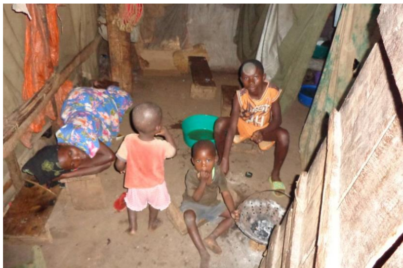
A mother and her children get some rest in one of the old tents of the district.

The “Suore Francescane del Monte” nuns have been constantly working to help this community and they still are an essential point of reference for the families.