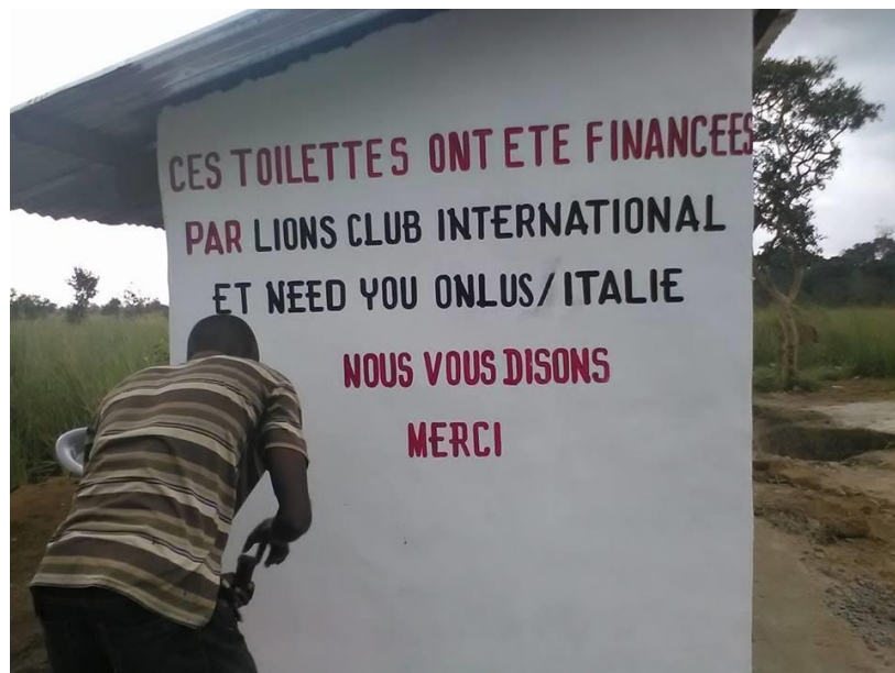
The new toilets of the school