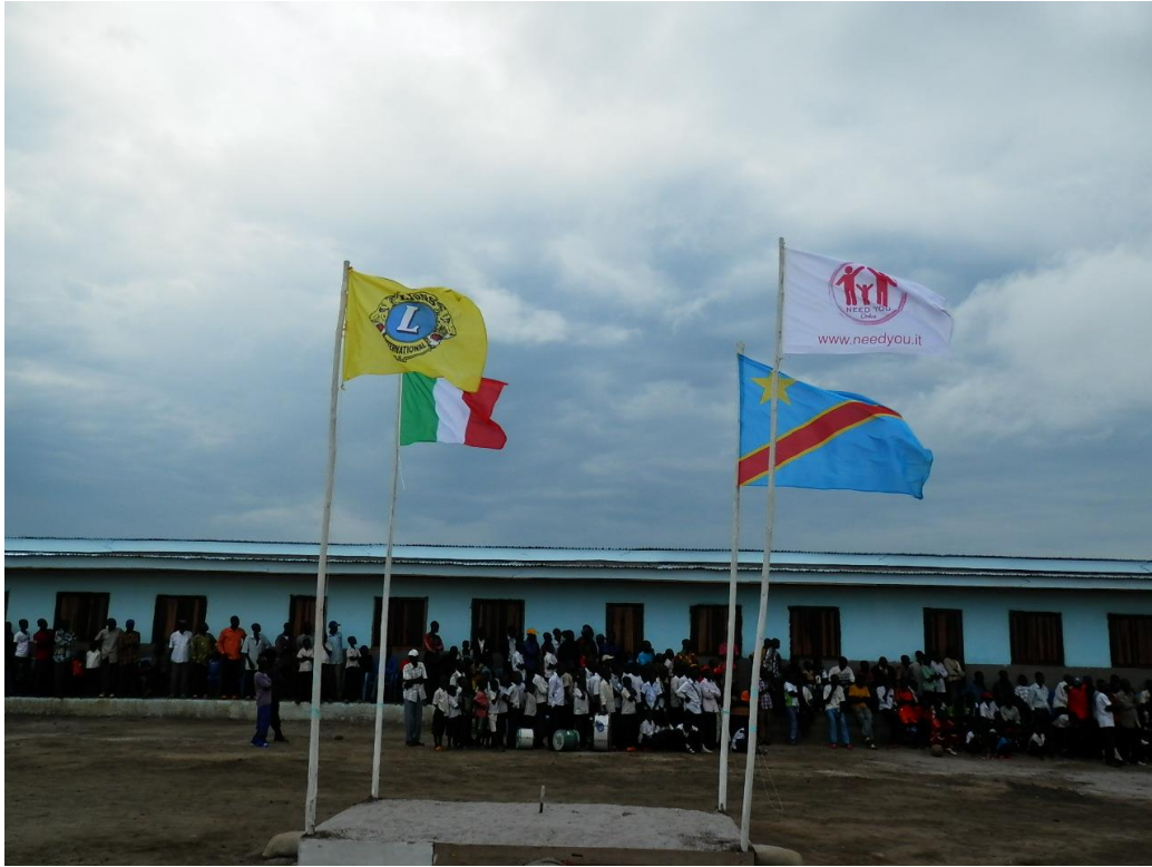
The inauguration of the school