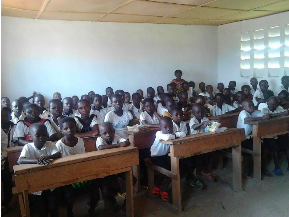
One of the new classrooms