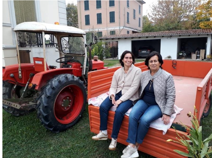
Our donors with the new tractor