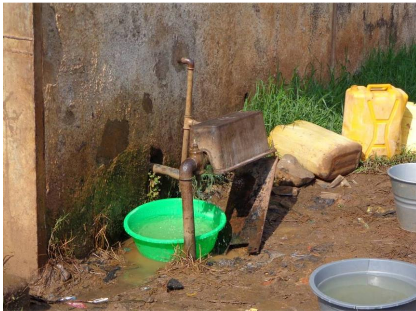
The only point of water supply for the 1.000 people of the village before the intervention of Need You Onlus.

We started helping the community of Bukavu in 2015. Giorgio Olivieri, architect and tireless volunteer, projected the construction of an actual village. With this project: each family would have a wooden house, would have access to decent toilets, children would be able to attend the school.