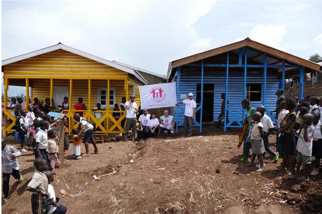
Our volunteers during the 2017 mission