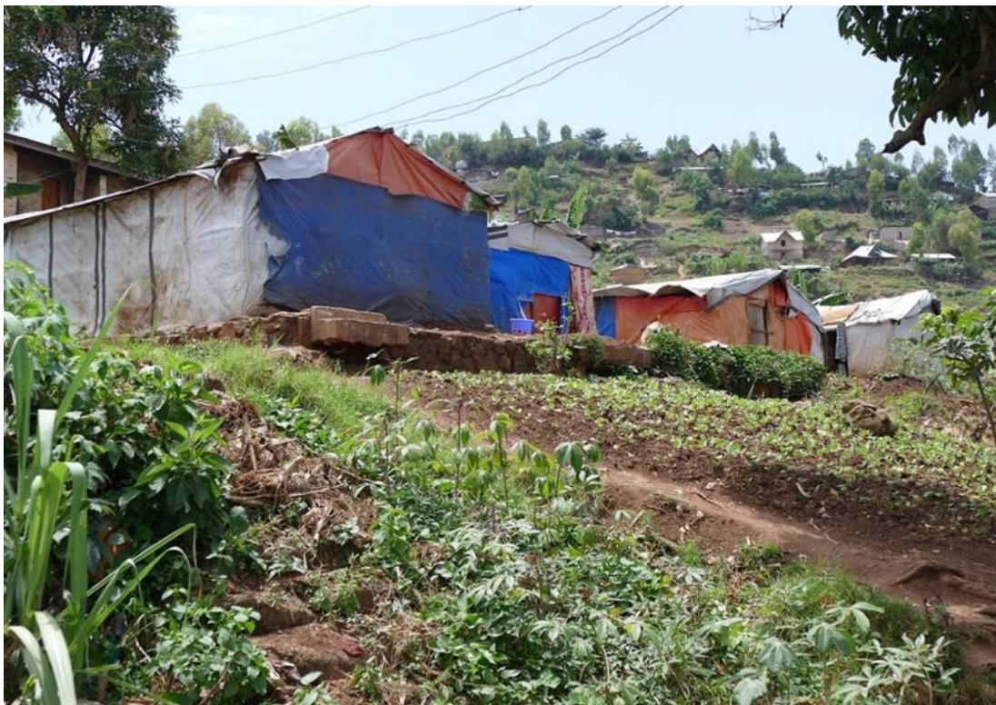
The temporary camp up on the hill.

The first step was to move the camp up on the hill. Rains are heavy and there aren't any paved road in the village so people sink in the mud and stay covered in dirt. By moving the camp up on the hill and by providing the families with better equipped tents, we could help them shelter better from the torrential rains.