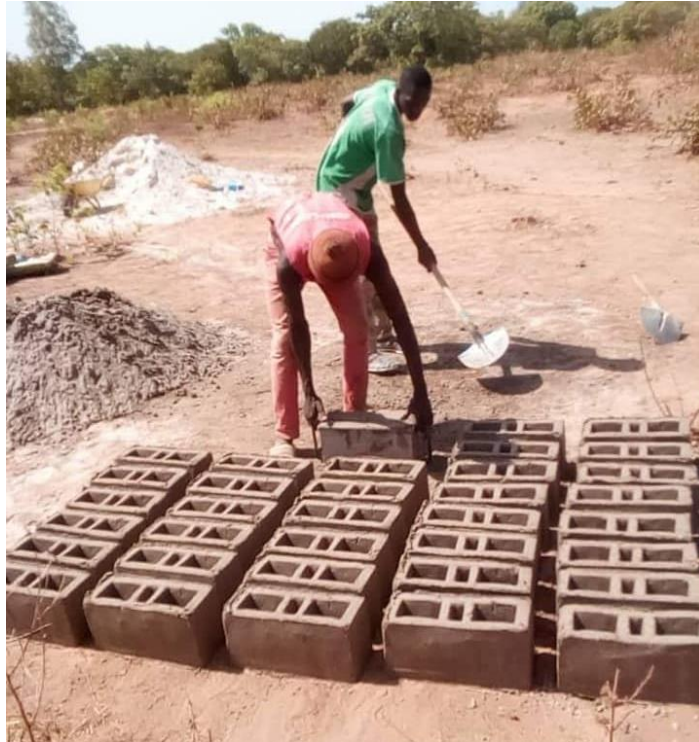
The beginning of the construction works