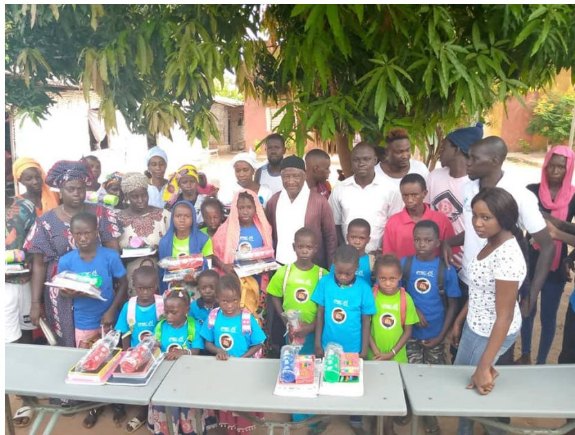
The children receive school materials