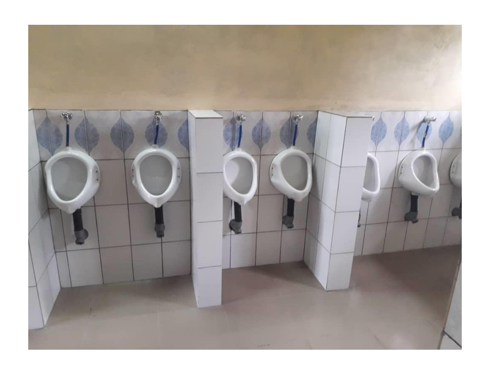
The new toilet facilities