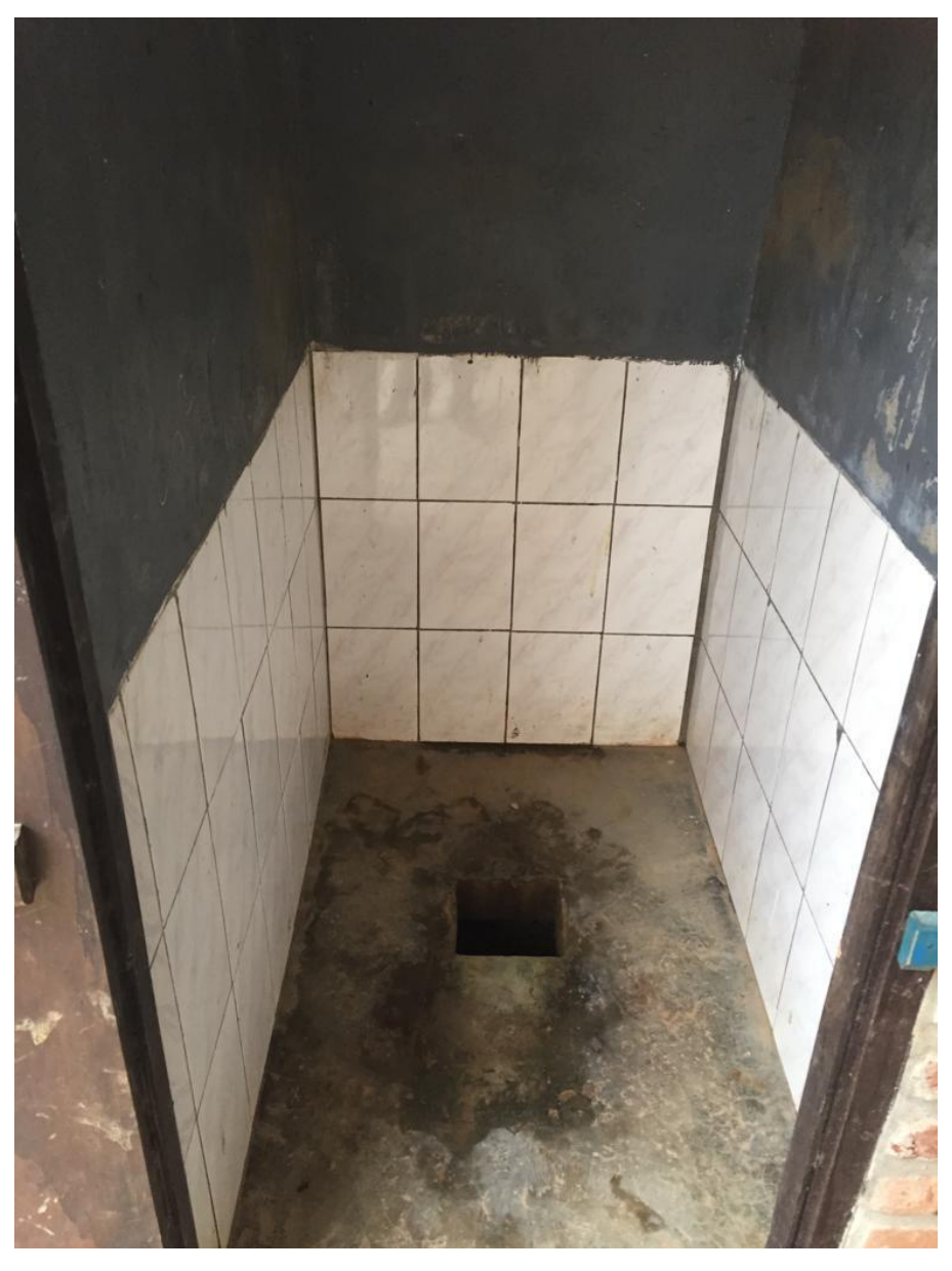
The state of the toilet facilities before the renovation

We also sent essential humanitarian goods such as t-shirts, 1.000 pens and men clothes.