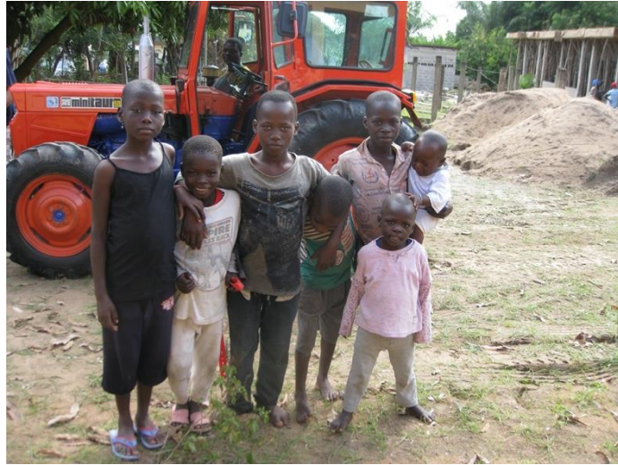
Children pose in front of the tractor