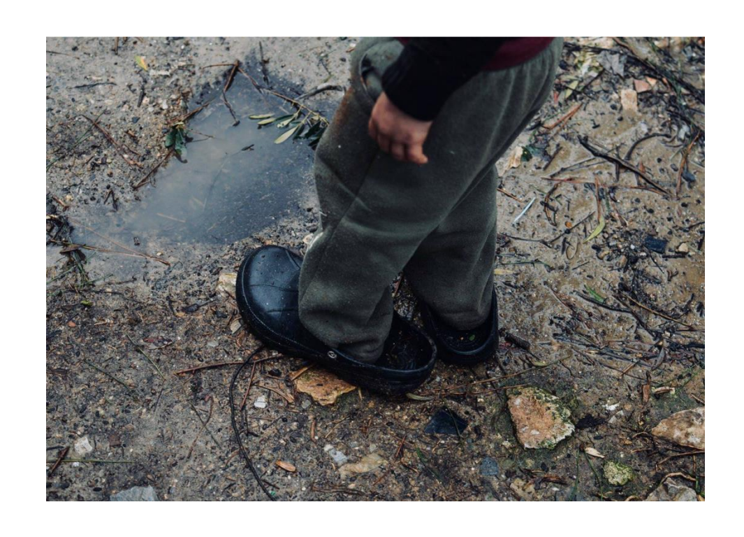
IT IS POSSIBLE TO SUPPORT ALL NEED YOU ONLUS PROJECTS AND COLLABORATIONS.

EACH PROJECT CAN HAVE THE LDS – LONG DISTANCE SUPPORT – SCHEME.