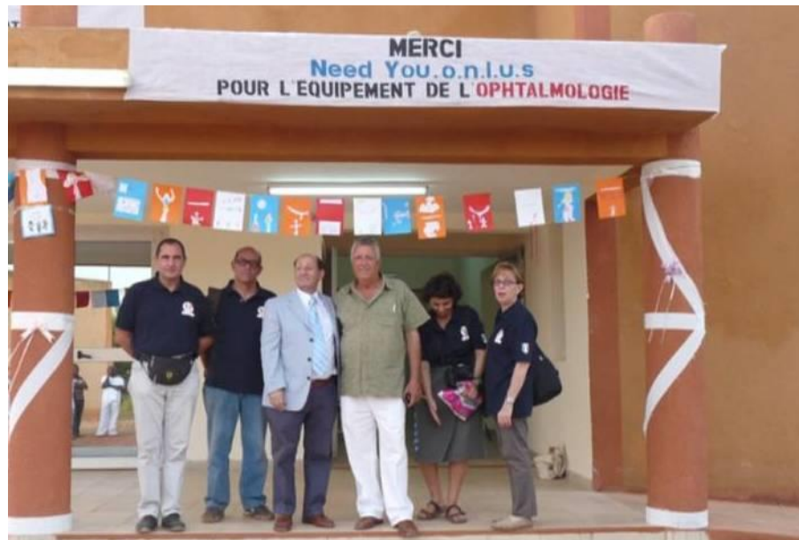
The new equipment

We sent both humanitarian and medical goods for the value of 80.000 €.