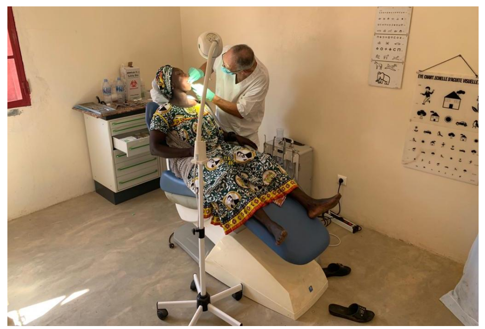
IT IS POSSIBLE TO SUPPORT ALL NEED YOU ONLUS PROJECTS AND COLLABORATIONS.

EACH PROJECT CAN HAVE THE LDS – LONG DISTANCE SUPPORT – SCHEME.