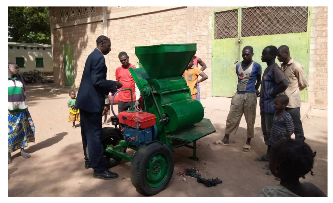
The new hulling machine